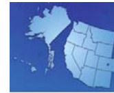
Western Regional Children's Advocacy Center