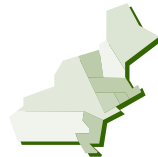
Northeast Regional Children's Advocacy Center