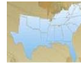
Southern Regional Children's Advocacy Center